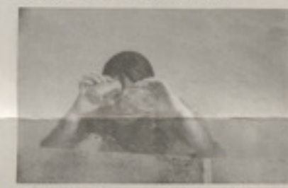
Boys don't make passes at girls who wear glasses.