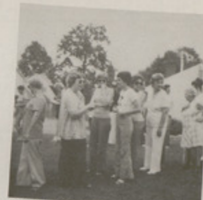
Are you sure this is the line for the Ladies Room?