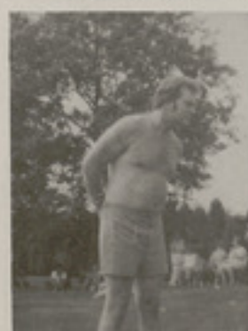
The olde evil eye always stops 'em cold.