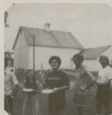
Where did you tell me to put this ear?