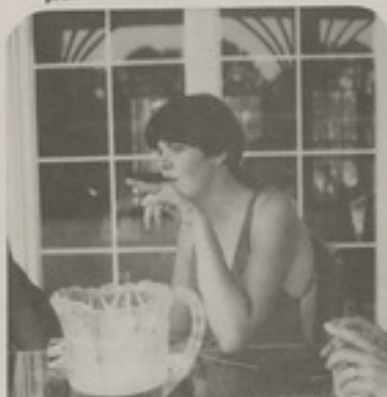
Don't YOU touch my beer!