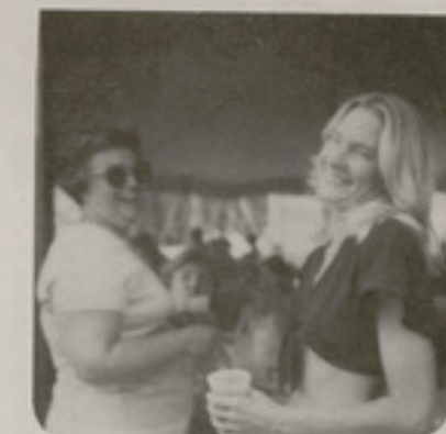
"And then the travelling salesman said . . ."