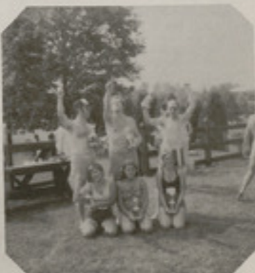
To the winners belong the spoils.