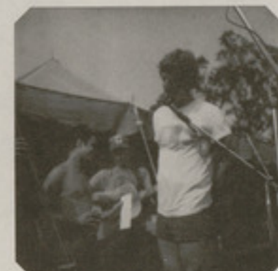
All we need is an art director who can really sing and dance.