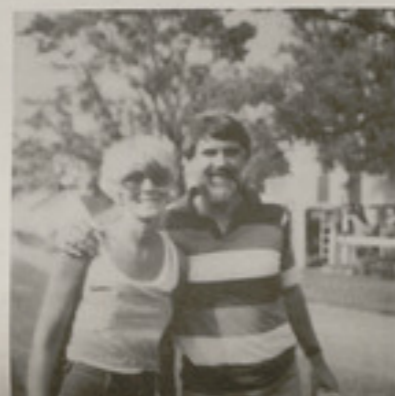
I know she looks like my wife.