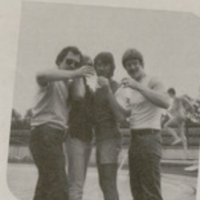
We may not be able to walk a straight line, but we can draw one.