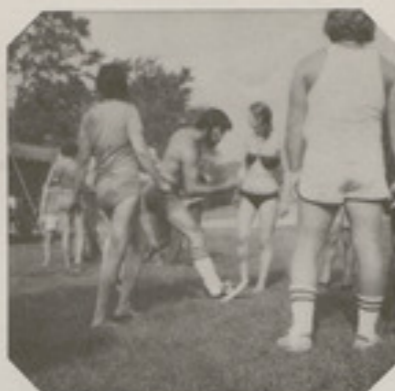
Then I grabbed her right arm and started the old hip toss.