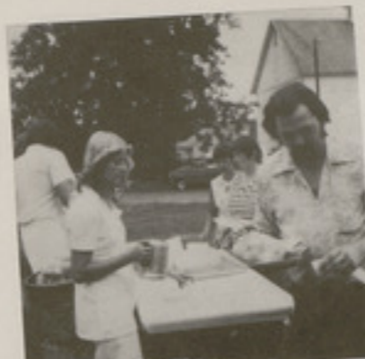
They think this motor oil is butter.