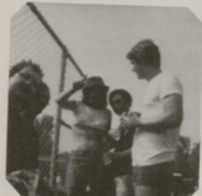
No way will you guys get me to have another beer.