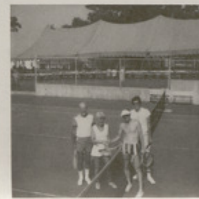
If we had played before I drank the beer I could have jumped the net.

Going into the final event, all teams buckled down and got very serious. Object of this event, HAGOD, was to make members of the other teams laugh without cracking up yourself. Any show of emotion resulted in a one point penalty against total team score. After the final event - Team 1 was able to break loose all the smiles they had been holding back . . . they had good reason. They had won the Rodale Press 1977 ALMOST ANYTHING GOES competition.