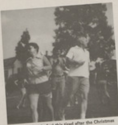
I usually only feel this tired after the Christmas promotions are in.