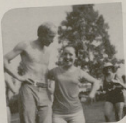
Since you're the new boy you have to go through the initiation.