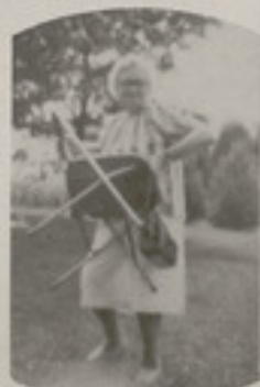
A lady has to protect her virtue against those young bucks.