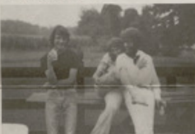
Shall I help her with the camera?