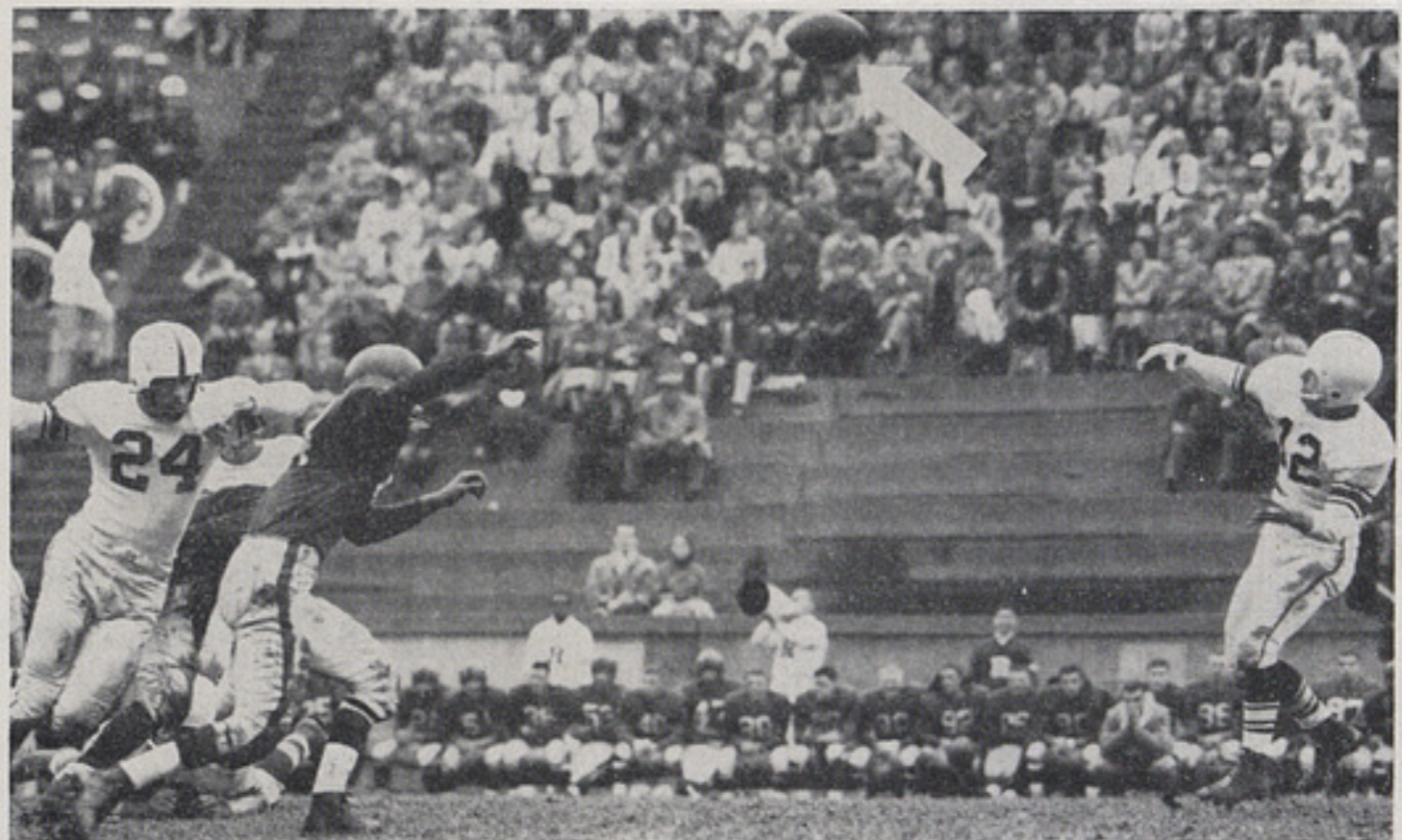
Lehigh's tremendous passing attack helped the Engineers defeat Rutgers 27-13.