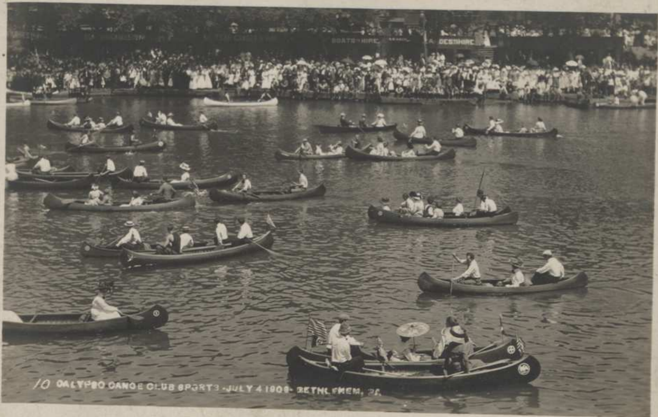
10 OLYMPIC CANOE CLUB SPORTS - JULY 4 1909 - BETHLEHEM, PA.