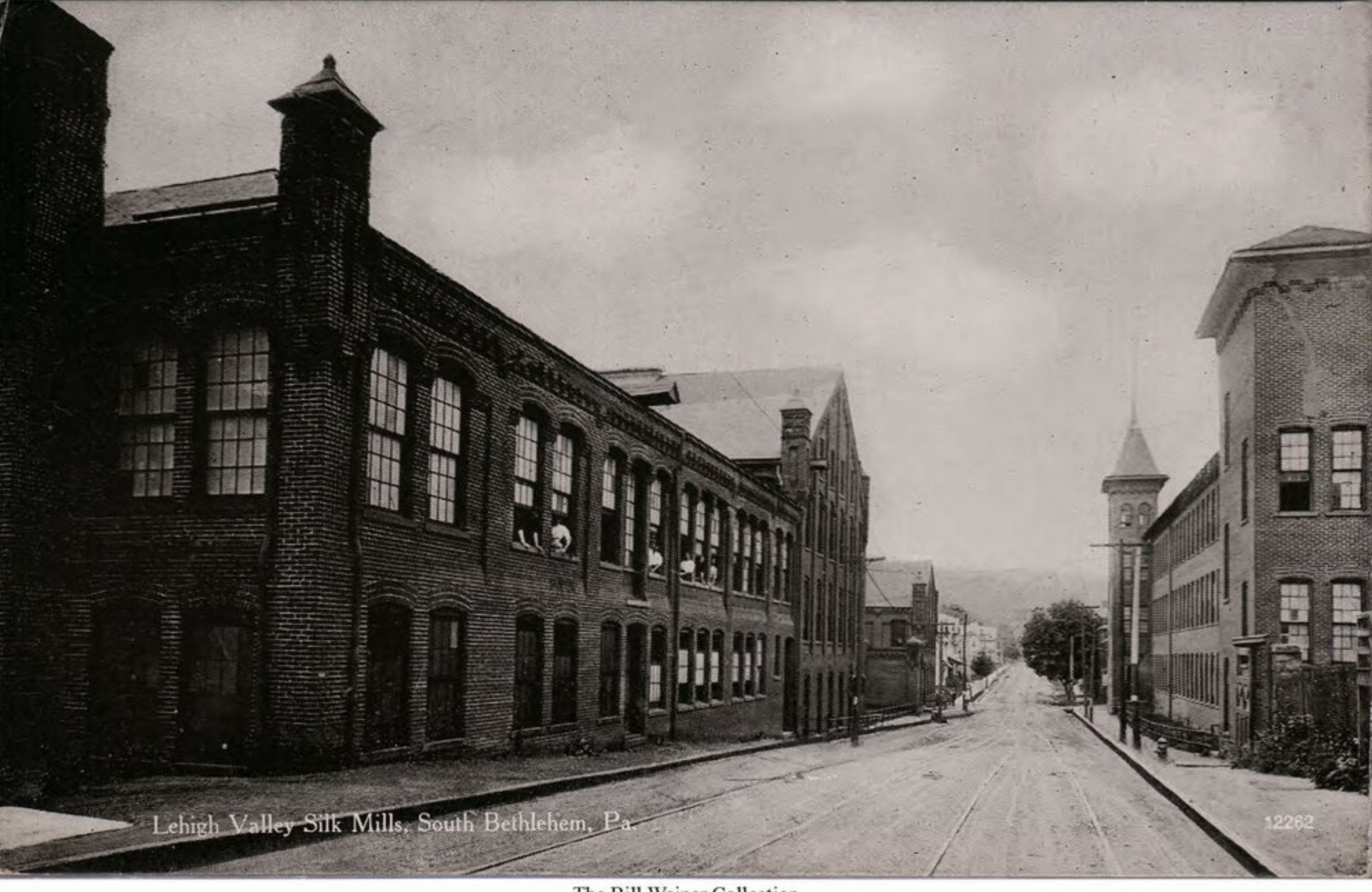
The Bill Weiner Collection