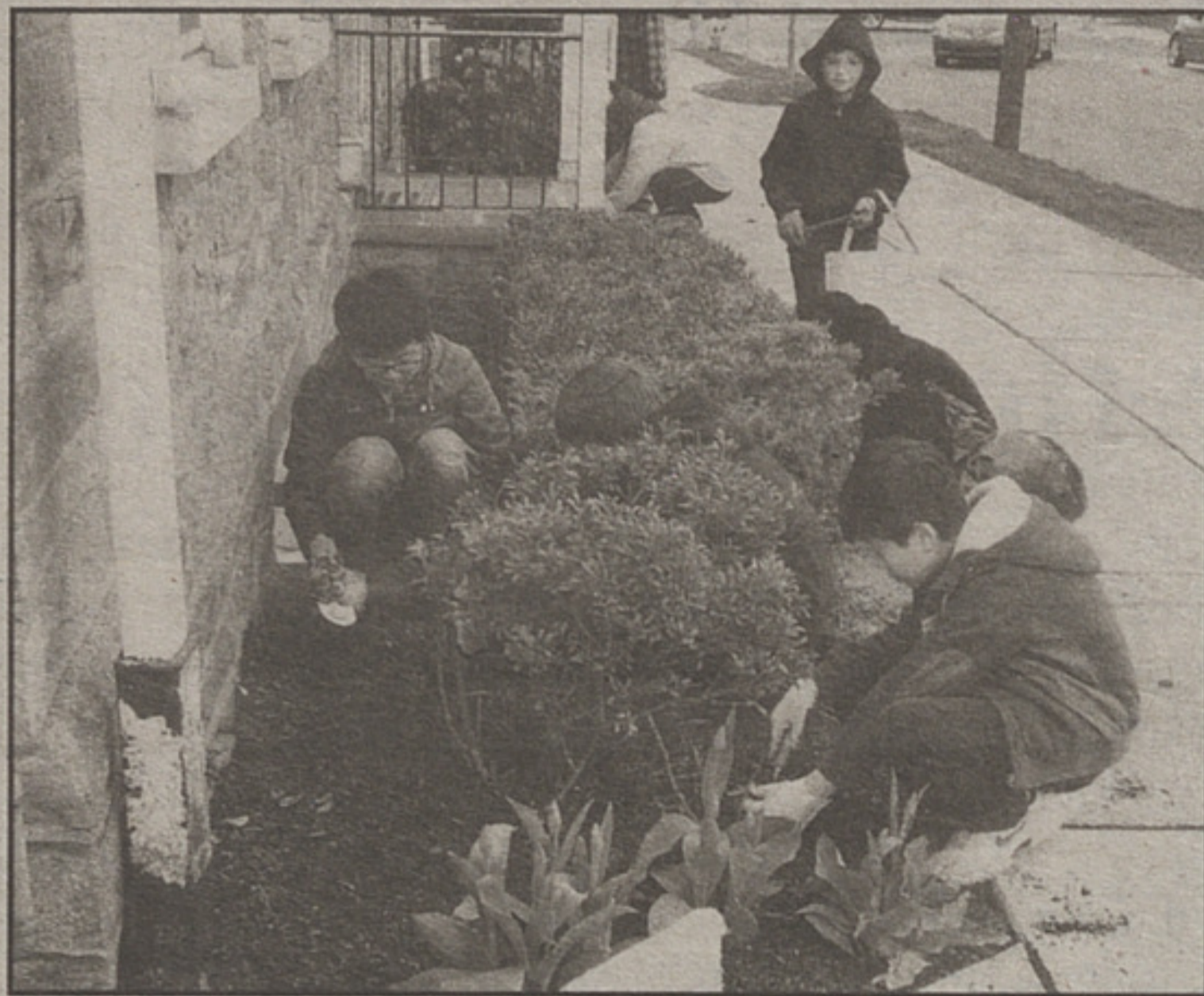
Students from St. Theresa School, Hellertown spruced up around Borough Hall. Children added mulch to flower beds and pulled weeds.

streetscape amenities such as banners, benches, tables, greening, and signs or promotional assistance. Details available at 610-841-5802.