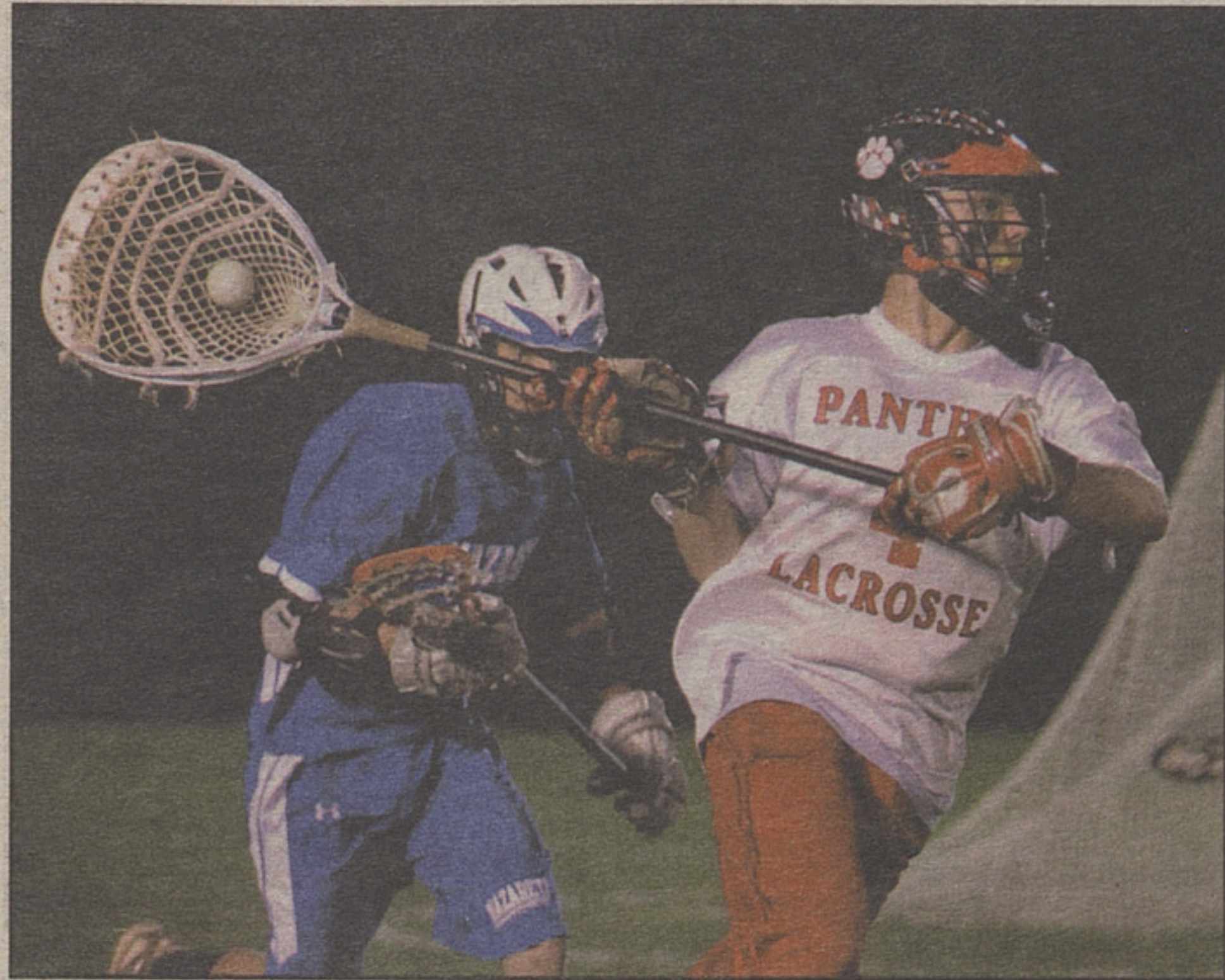
Saucon Valley High School's lacrosse program continues full-force, in action against Nazareth, with home games at Montford Illick Stadium.