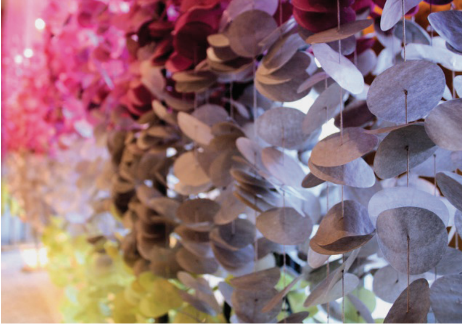
hannah cochran Dot Window Display